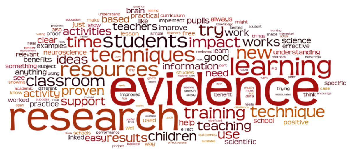
Figure 3. Wordle illustration (in which the frequency of the word is proportional to its size) of free-text responses to the question, "What would deter you from trying out a new activity or technique linked to neuroscience?"

Figure 2. Wordle illustration (in which the frequency of the word is proportional to its size) of free-text responses to the question, "What would encourage you to try out a new activity or technique linked to neuroscience?"<sup>21</sup>